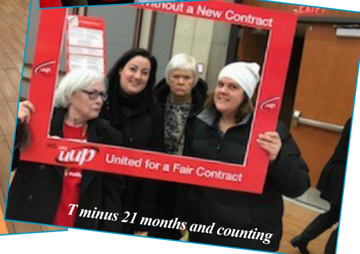
T minus 21 months and counting