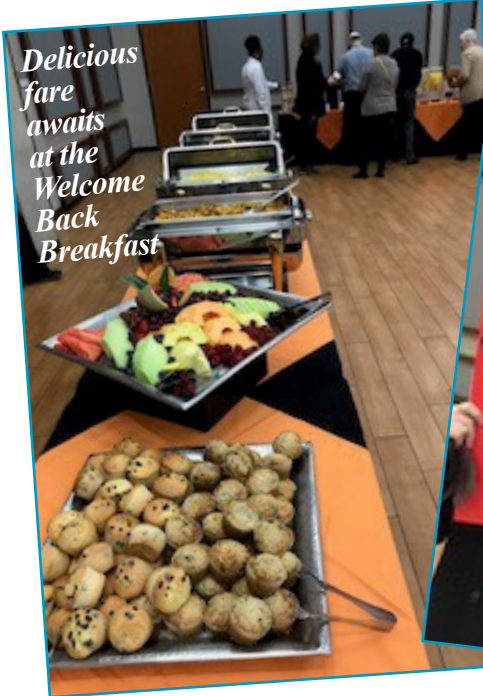
Delicious fare awaits at the Welcome Back Breakfast