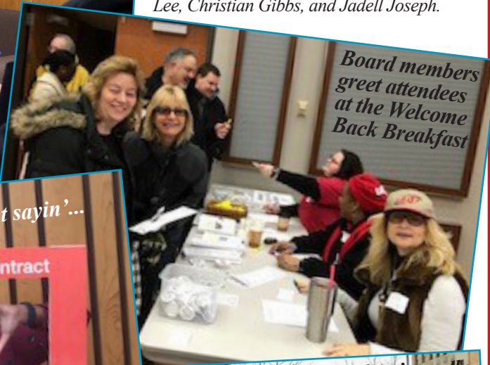
Board members greet attendees at the Welcome Back Breakfast