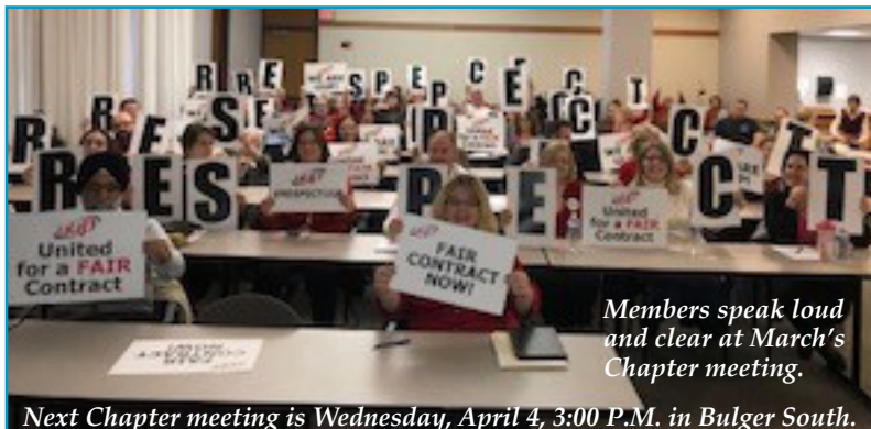
Members speak loud and clear at March's Chapter meeting.

F inally, check out page 4 -- and plan to attend the UUP Member Benefits Expo, April 25, 10:00 A.M. till 2:00 P.M. in Butler 210.