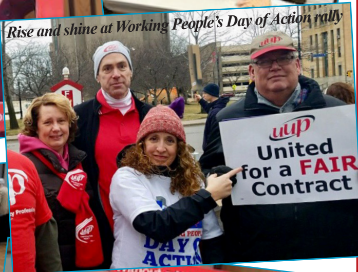
Rise and shine at Working People's Day of Action rally